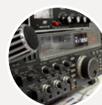
Amateur radio operators